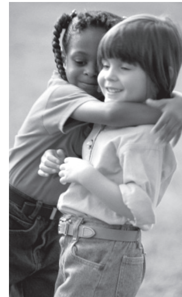
The Assessment of English Learners

California Association of School Psychologists